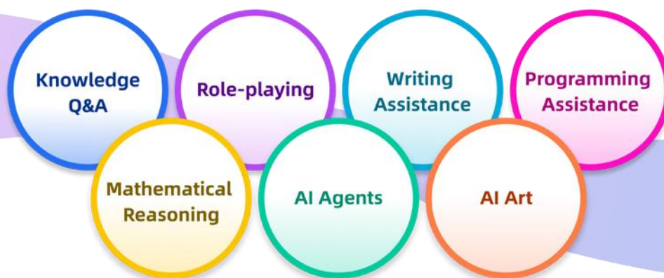
Figure 1. Main Service Areas of Generative AI